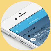
Software as a Service